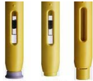
Before use (with grey needle shield) Just prior to use (without grey needle shield) After use (yellow needle safety cover comes down)

The yellow safety cover will move down over the needle and lock into place. The inspection window will be yellow, confirming the injection is complete.