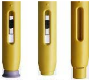
Before use (with grey needle shield) Just prior to use (without grey needle shield) After use (yellow needle safety cover comes down)

The yellow safety cover will move down over the needle and lock into place. The inspection window will be yellow, confirming the injection is complete.